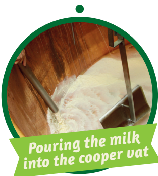
Pouring the milk into the cooper vat