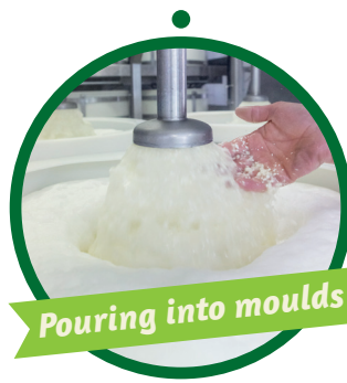
Pouring into moulds